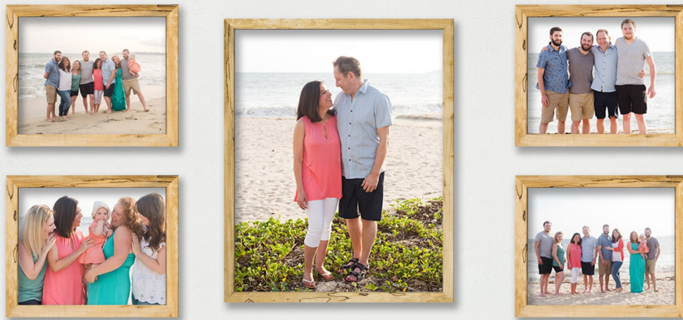
This is the five frame gallery set in Maple.