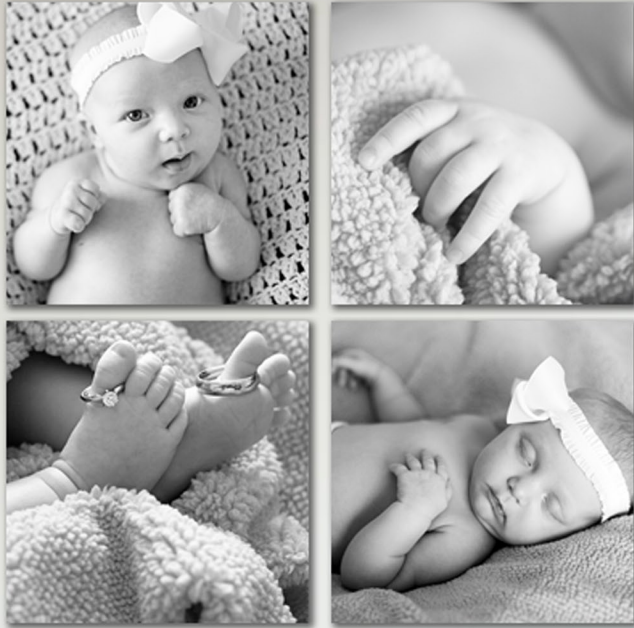
20 x20 Canvas wrap fine art prints. For the 4 wall collection priced at $850. Individual 20x20 canvas prints at $275 each.