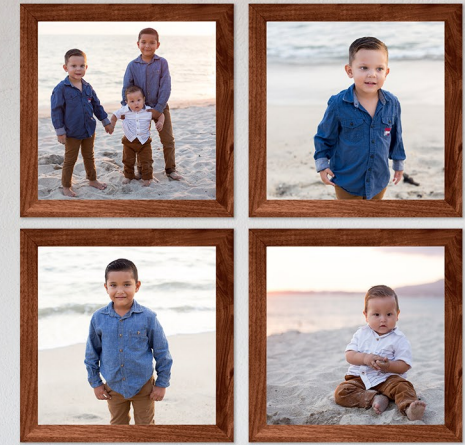
Four 12x12 Walnut framed prints