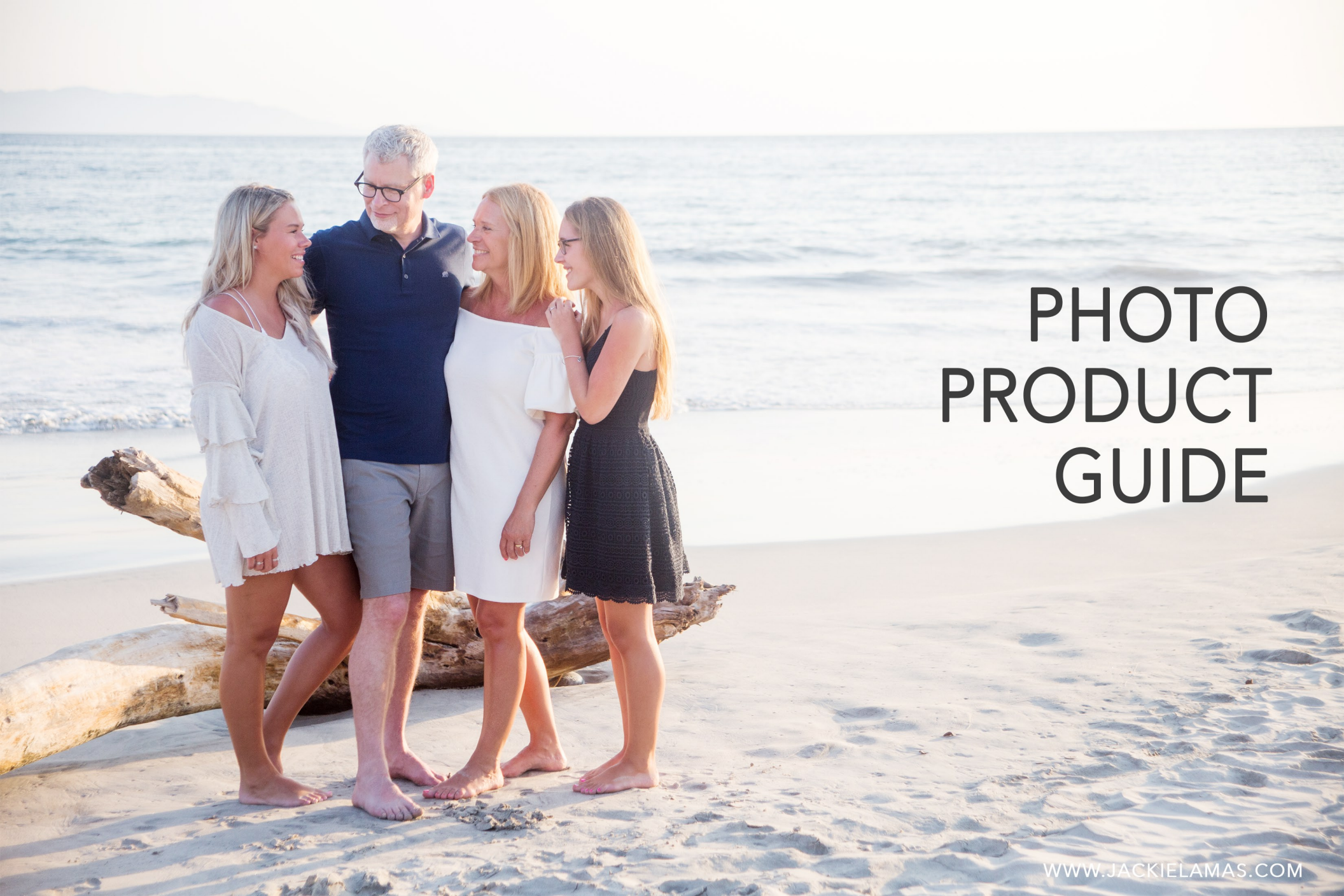
PHOTO PRODUCT GUIDE